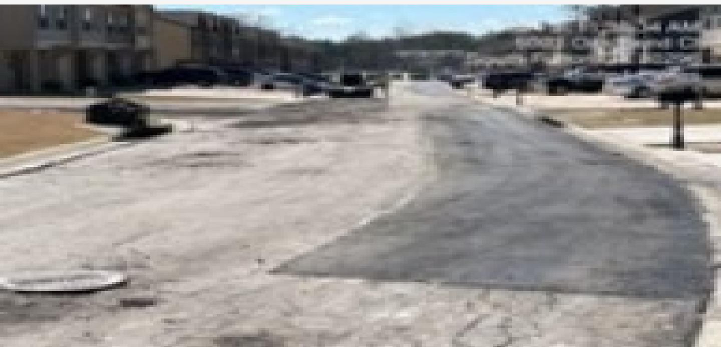
Oaks at Flat Shoals Paving