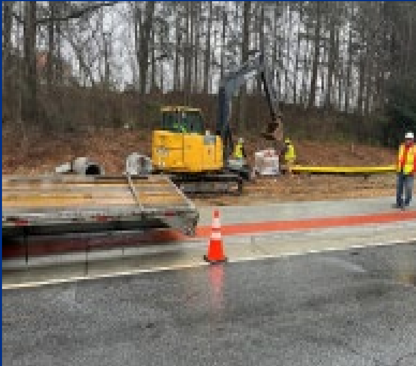
Fairburn Road Bridge over N Utoy Creek – Phase II