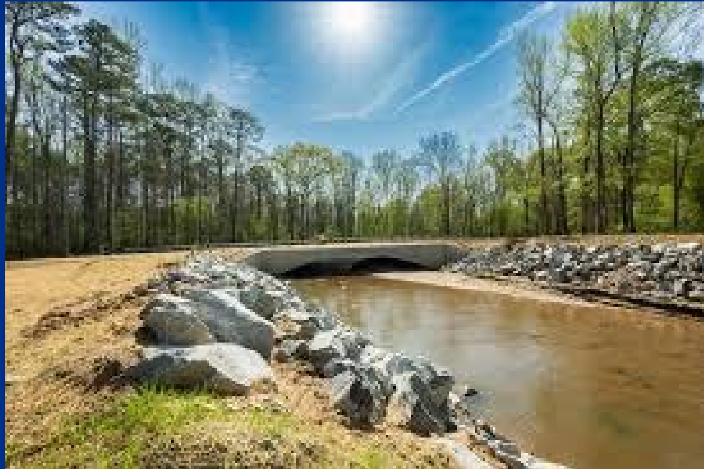
Cochran Road over Deep Creek Bridge Project