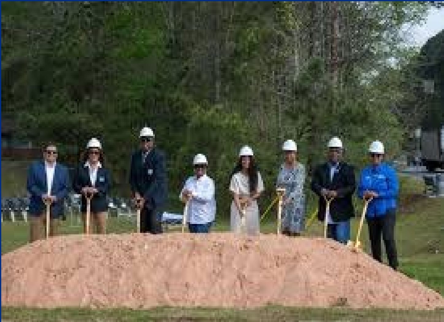
Old National Sidewalk Project Groundbreaking